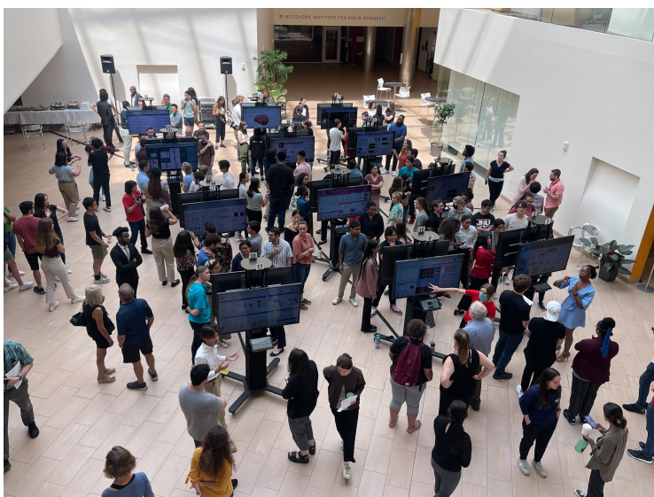
MSRP Poster Session, August 2023.