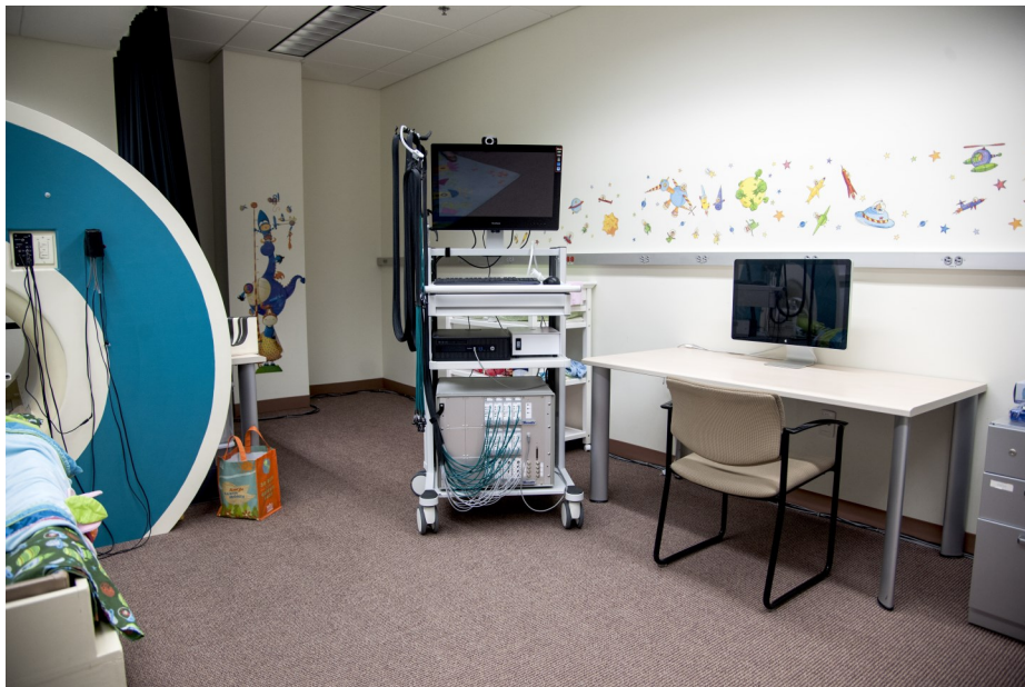
NIRS Facility

Researchers in the Department of Brain and Cognitive Sciences at MIT are exploring the neuroscience behind social cognition and behavior. Individuals and families can play an important role in making these discoveries by participating in research. Several research studies are actively recruiting volunteers with and without autism spectrum disorders. The Simons Center actively supports these projects.